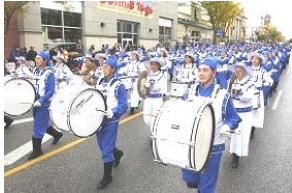
The Divine Land Marching Band

In early 2004, my sister was diagnosed with late-stage cervical cancer. After only a few days of chemotherapy, she began to vomit and had constant pain. She tried a lot of other non-traditional healing methods, but none worked. Some kindhearted friends said to her, "Practice Falun Dafa and see if it helps you." My sister did not believe them, but seeing her in pain, her husband also suggested, "Everyone says it's good, why don't you just give it a try?" She decided to give Falun Dafa a chance. Immediately, she experienced a change. From not being able to eat or drink, she could now eat a whole bowl of rice. Her swollen stomach became normal, and she could walk faster than anyone! Less than a week after beginning her cultivation practice in Dafa, some of the ailments that had plagued her for 25 years were healed! Her doctor was amazed, because from a medical point of view, people at her stage of illness could live no longer than six months.